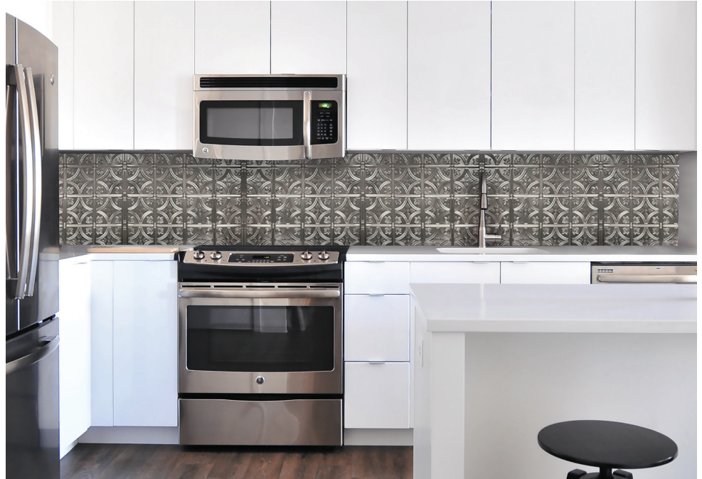
Single Panel View (2' x 2')